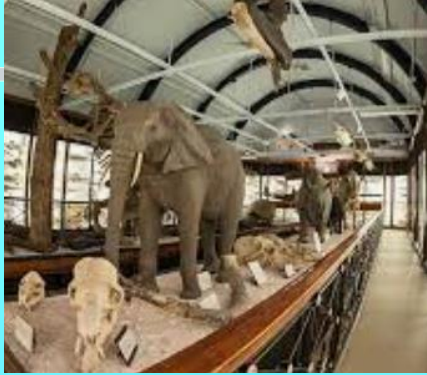
Tring Science Museum