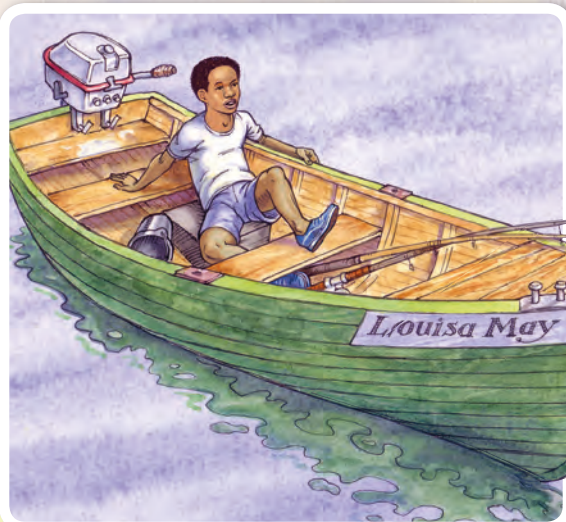
An Encounter at Sea