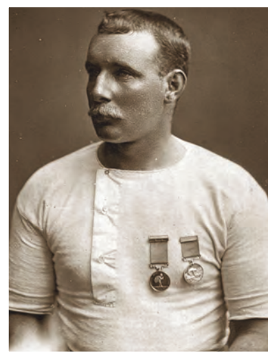
Captain Matthew Webb

Many of the hardships that Matthew Webb had to deal with during his pioneering swim are still faced by modern-day Channel swimmers. In fact, some of his methods for dealing with these hardships are still used today. Webb coated himself in oil for protection against the cold and jellyfish stings. He was also accompanied by boats so his friends could protect and feed him. It must be said, however, that the ale, brandy and beef tea they supplied are not standard for today's cross-Channel swimmers!