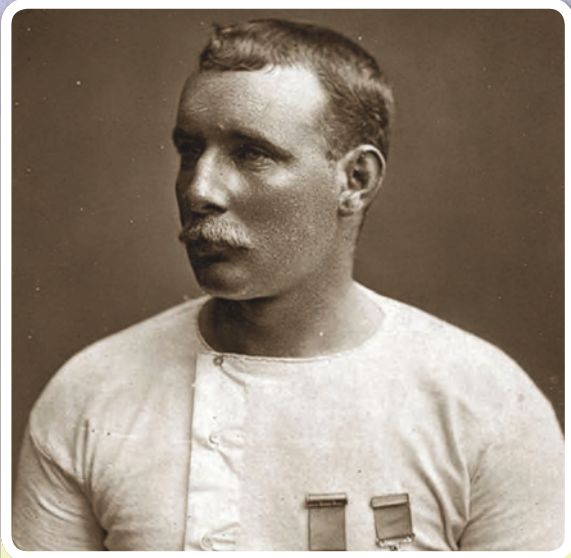
Swimming the English Channel