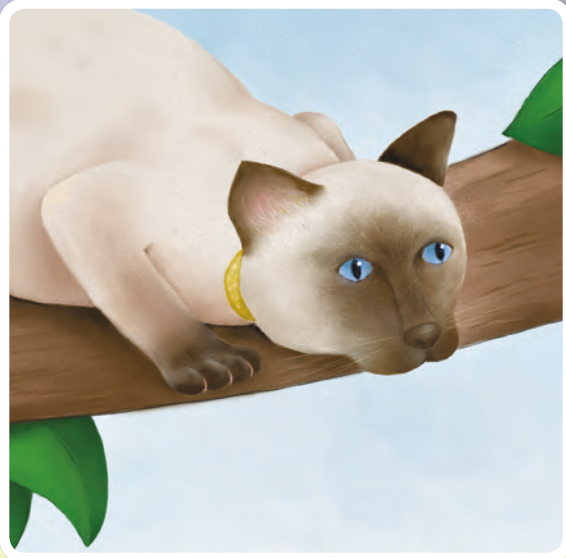
Gaby to the Rescue