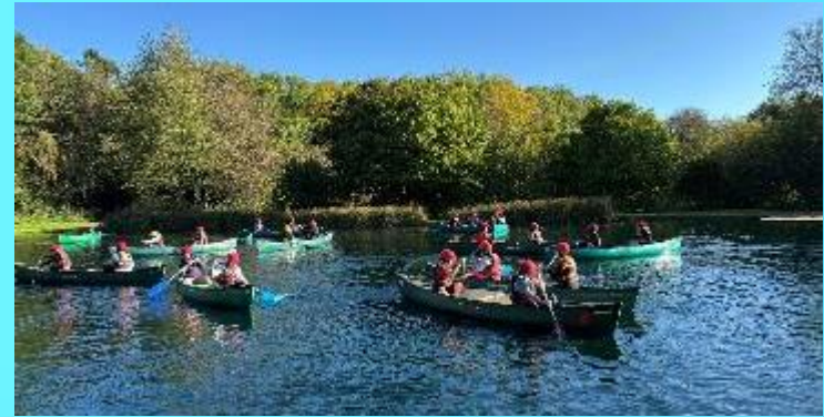
Residential trip Sun 28 th June – Wed 1 st July

We hope to offer a range of other exciting enrichment opportunities throughout the school year.