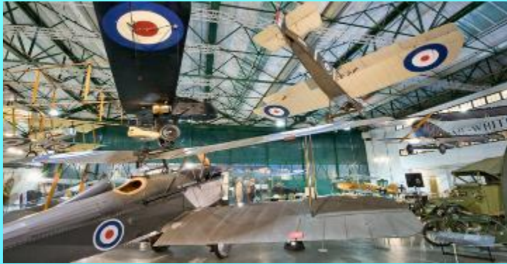
RAF Hendon 21 st October