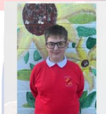
Equality and Diversity Minister - Ed