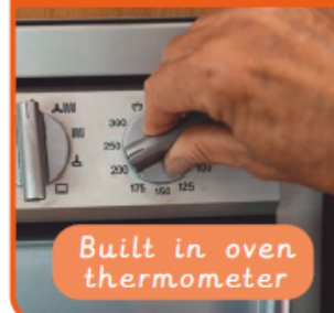
Built in oven thermometer

Today we have a range of safe non-toxic, smart and digital thermometers: