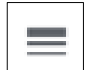
Line Weight Tool