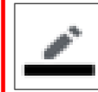
Line colour Tool