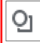
Draw Shapes Tool