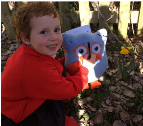
Bertie Owl exploring signs of spring