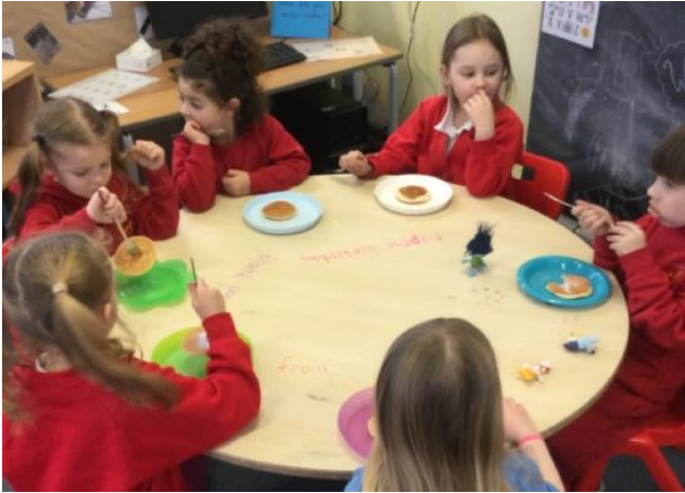
Trying pancakes on Pancake day