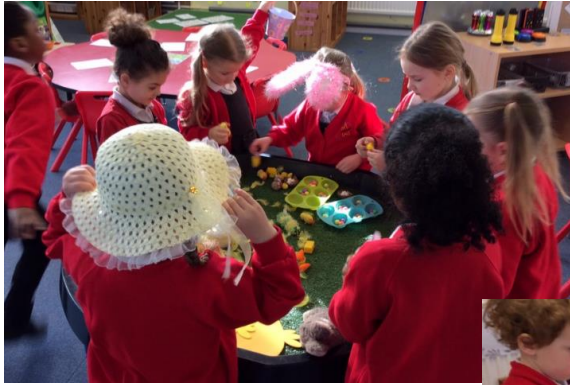
Celebrating Easter during child initiated play