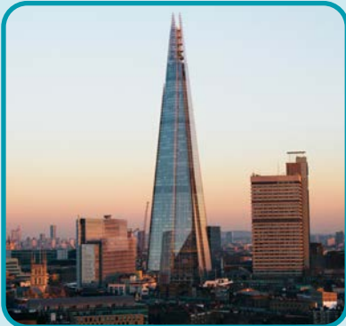
The Shard, London (Renzo Piano)