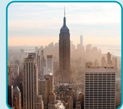
Empire State building, New York City (Shreve, Lamb & Harmon)