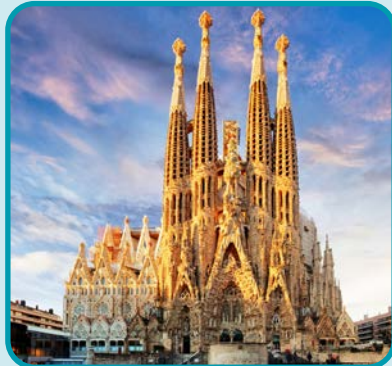
La Sagrada Familia, Barcelona (Antoni Gaudi)