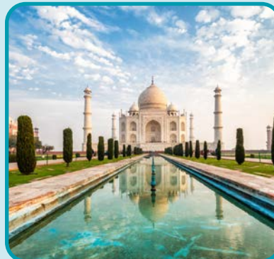
Taj Mahal, India (Ustad Ahmad Lahori)