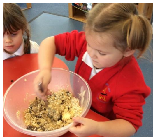
Making healthy flapjacks during our focus on the text 'The Little Red Riding Hood.'