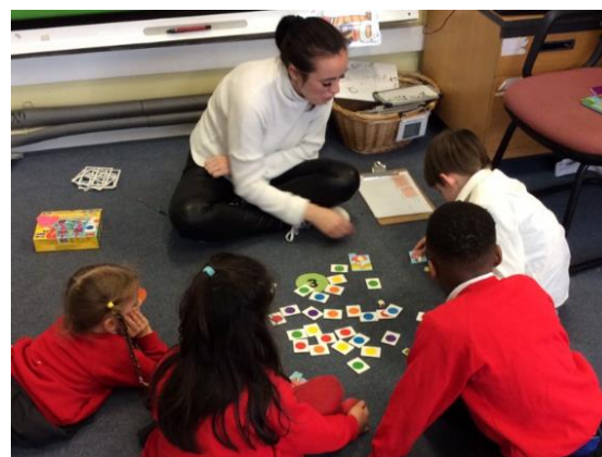
Learning how to take turns during a group task