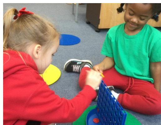
Taking turns independently during choosing time