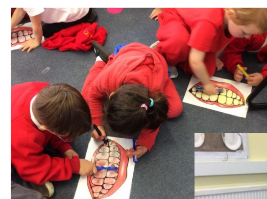
Understanding importance of health-visit from the local dentist and nurse