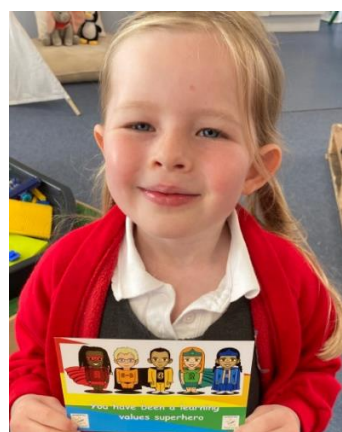
Receiving a super power postcard