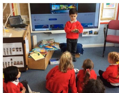
Building and showing confidence in show and tell