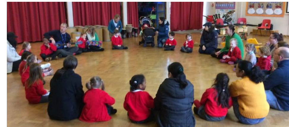
Parents involved in our music lesson