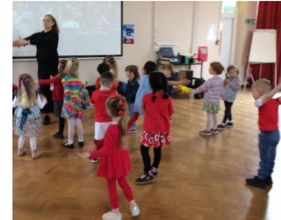
Coronation dance class