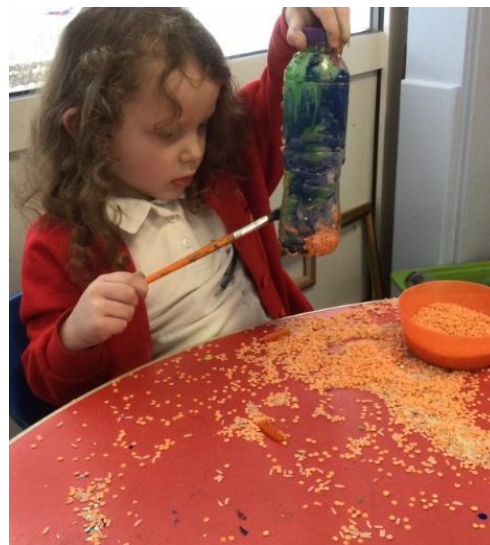
Making our own instruments