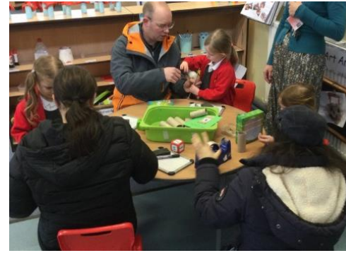
EAD share and learn