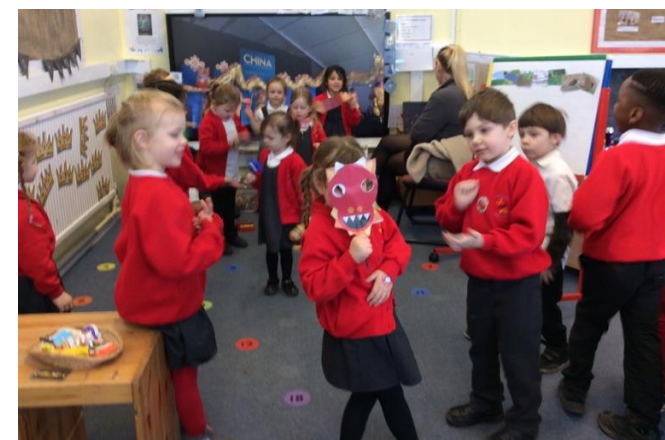
Dragon dance during Chinese New Year