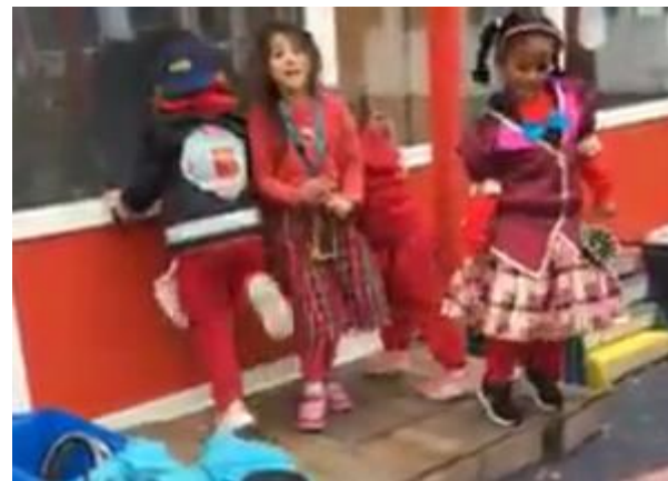
Using our outdoor stage